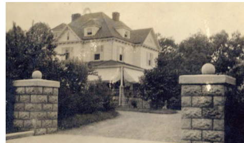
Maurer Mansion around the turn of the century.

The monies made from these two fund raisers and the donations from local businesses and