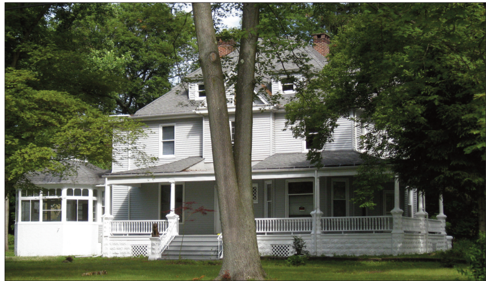
Newly painted, the Maurer Mansion, will be one of Dunellen’s most prominent fixtures in town once fully renovated.

The historic Maurer House situated on the corner of Madison Avenue and Mountainview Terrace has seen many changes over the years. Its Queen Anne-Colonial Revival architecture was popular in the late 1800’s. Despite years of neglect, recent attention has heads turning and folks asking, “What’s going on with the house?”