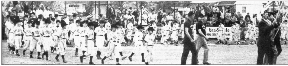
1956 - Dunellen Little League Little League Opening Day Parade