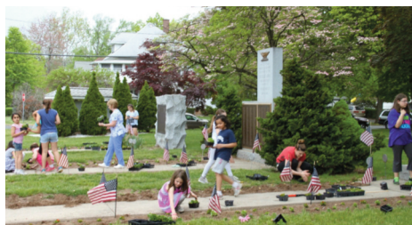
Troops & Leaders hard at work, planting flowers at Washington Memorial Park in Dunellen

This is just one of the many annual traditions Dunellen enjoys and I want to thank all the girls, parents and troop leaders who make this possible. I hope everyone enjoys!