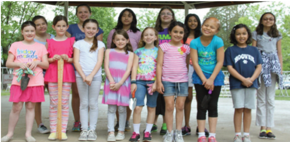
Cadette Troop # 65963 & Brownie Troop # 65515 pose for a picture before getting to work